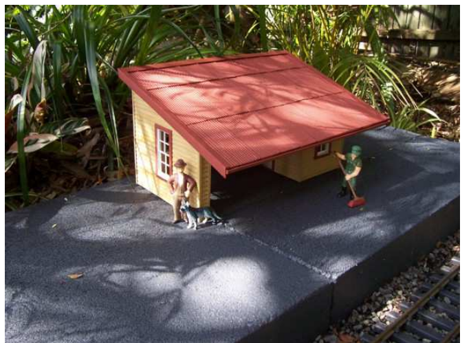
Corrugated roofing sheets glued on.

The completed model set up on Garden Railway ready to serve the people and goods traffic.