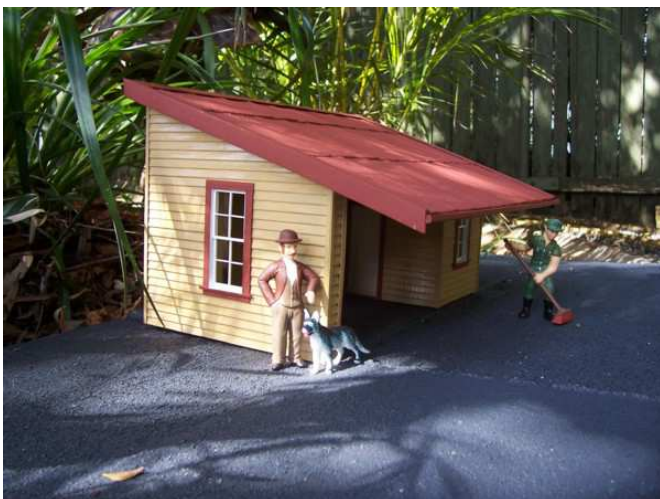
Profiled styrene wall cladding was glued to plywood.