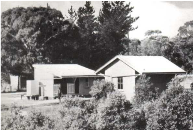
The basis for this model was the Station at Amiens QLD.